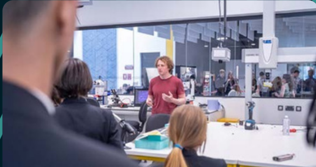
Maker Space - a collaborative design and manufacturing facility available to industry partners and students across the University .