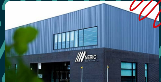
The Northern Engineering and Robotics Innovation Centre is a beacon for the University's robotics and automation specialisms