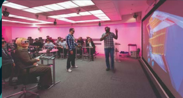
THINKlab - a unique centre for advancing digital innovation to solve global challenges