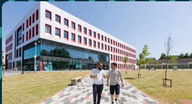
New £65million SSEE building for engineering, computing and architecture, opened in 2022