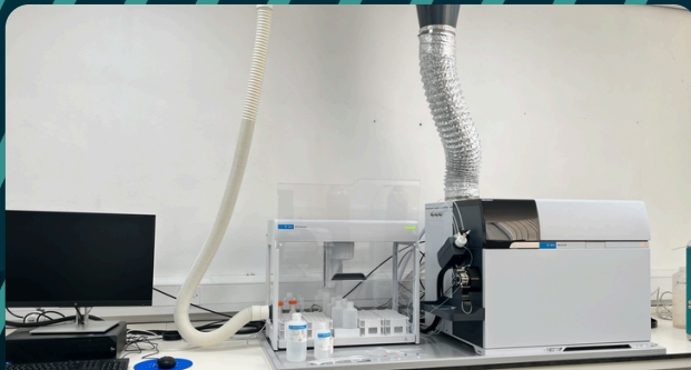
Collins Suite - awarded LEAF bronze award this environmental laboratory is used in the research of soil, water and crops