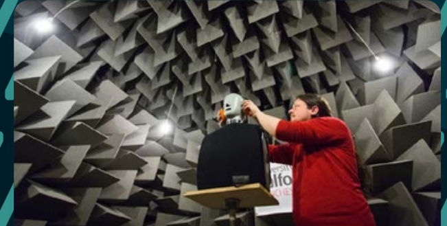
World leading Acoustics Research Centre